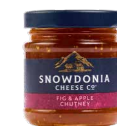
Fig & Apple Chutney 114g Rich and succulent figs with silky chunks of Bramley apple

Ravida Extra Virgin Olive Oil 250ml A complex and aromatic olive oil from Sicily