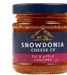
Fig & Apple Chutney 114g Rich and succulent figs with silky chunks of Bramley apple

Balsamic Caramelised Onion Chutney 100g Sweet caramelised onions and aged balsamic vinegar