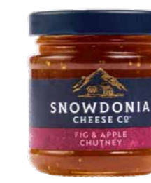
Fig & Apple Chutney 114g Rich and succulent figs with silky chunks of Bramley apple

Balsamic Caramelised Onion Chutney 100g Red onions caramelised with muscovado sugar and paired with aged balsamic vinegar of Modena