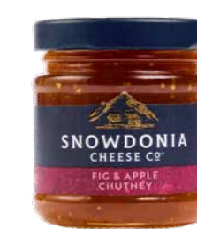
Fig & Apple Chutney 114g Rich and succulent figs with silky chunks of Bramley apple

Rhubarb & Gin Chutney 114g Sweet, zingy rhubarb with aromatic London dry gin