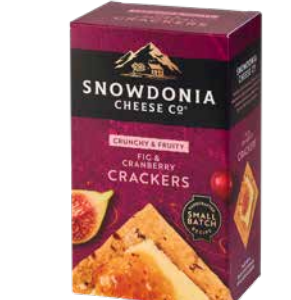
Fig & Cranberry Crackers 100g Delectably sweet crackers with figs, cranberries and extra virgin olive oil

Truffle Trove 150g Luxuriously rich extra mature Cheddar infused with Italian Black Summer truffle