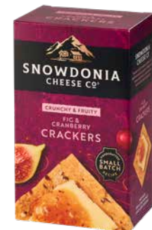
Fig & Cranberry Crackers 100g Delectably sweet crackers with figs, cranberries and extra virgin olive oil

Truffle Trove 150g Luxuriously rich extra mature Cheddar infused with Italian Black Summer truffle