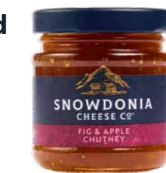
Fig & Apple Chutney 114g Rich and succulent figs with silky chunks of Bramley apple

Balsamic Caramelised Onion Chutney 100g Red onions caramelised with muscovado sugar and paired with aged balsamic vinegar of Modena