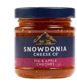
Fig & Apple Chutney 114g Rich and succulent figs with silky chunks of Bramley apple

Olives Et Al Nocellara Belice Sicilian Olives 250g Buttery and sweet green olives