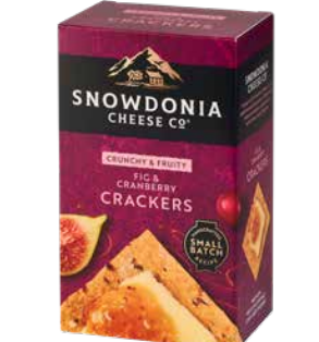
Fig & Cranberry Crackers 100g Delectably sweet crackers with figs, cranberries and extra virgin olive oil

Truffle Trove 150g Luxuriously rich extra mature Cheddar infused with Italian Black Summer truffle