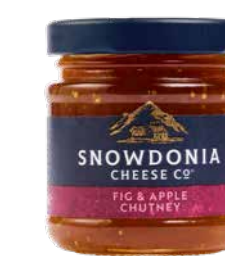
Fig & Apple Chutney 114g Rich and succulent figs with silky chunks of Bramley apple

Balsamic Caramelised Onion Chutney 100g Sweet caramelised onions and aged balsamic vinegar