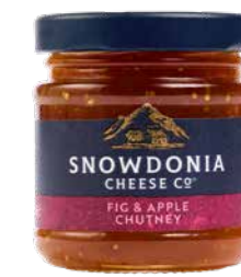
Fig & Apple Chutney 114g Rich and succulent figs with silky chunks of Bramley apple

Belgid'Or Belgian Cocoa-Dusted Salted Caramel Truffles 200g Cocoa-dusted Belgian truffles with salted caramel nuggets