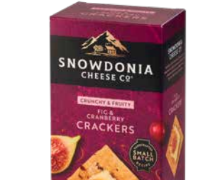
Fig & Cranberry Crackers 100g Delectably sweet crackers with figs, cranberries and extra virgin olive oil

Truffle Trove 150g Luxuriously rich extra mature Cheddar infused with Italian Black Summer truffle