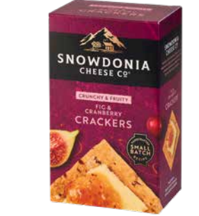
Fig & Cranberry Crackers 100g Delectably sweet crackers with figs, cranberries and extra virgin olive oil

Truffle Trove 150g Luxuriously rich extra mature Cheddar infused with Italian Black Summer truffle