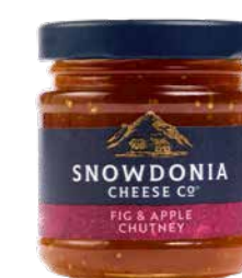
Fig & Apple Chutney 114g Rich and succulent figs with silky chunks of Bramley apple