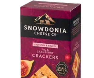
Fig & Cranberry Crackers 100g Delectably sweet crackers with figs, cranberries and extra virgin olive oil

Black Bomber Welsh Rarebit Cheese Bake 150g A rich and velvety dip with Cheddar, ale and wholegrain mustard, served hot from the oven