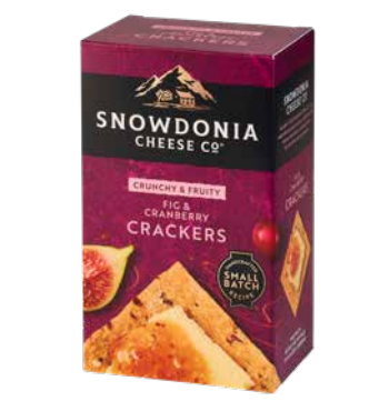
Fig & Cranberry Crackers 100g Delectably sweet crackers with figs, cranberries and extra virgin olive oil

Beech Wood 200g Mature Cheddar, naturally cold-smoked over beechwood for a mellow depth and warmth