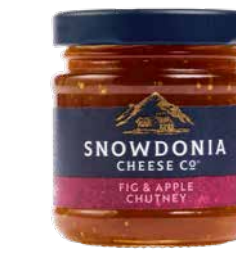
Fig & Apple Chutney 114g Rich and succulent figs with silky chunks of Bramley apple

Senorio Bellota 100% Iberico Hand-Carved Ham 50g An intensely savoury acorn-fed ham