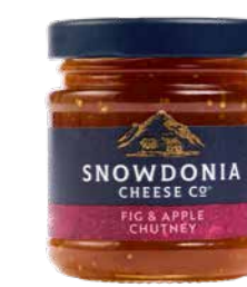
Fig & Apple Chutney 114g Rich and succulent figs with silky chunks of Bramley apple

Willie's Cacao Sea Flakes Chocolate Bar 50g Milk chocolate with a touch of sea salt