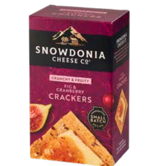
Fig & Cranberry Crackers 100g Delectably sweet crackers with figs, cranberries and extra virgin olive oil

Truffle Trove 150g Luxuriously rich extra mature Cheddar infused with Italian Black Summer truffle